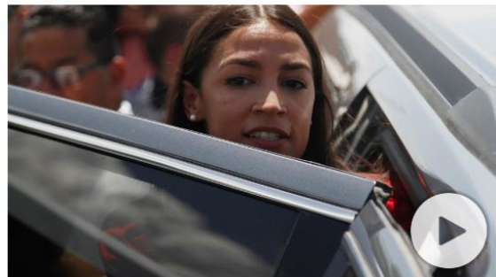
CBP border chiefs refute AOC detention center claims Democrats push for open border policies; Todd Piro reports.