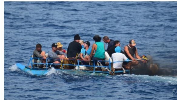
The Coast Guard found this group of Cuban migrants south of Key West, Florida, on September 13.

Updated 7:15 PM ET, Tue September 22, 2015